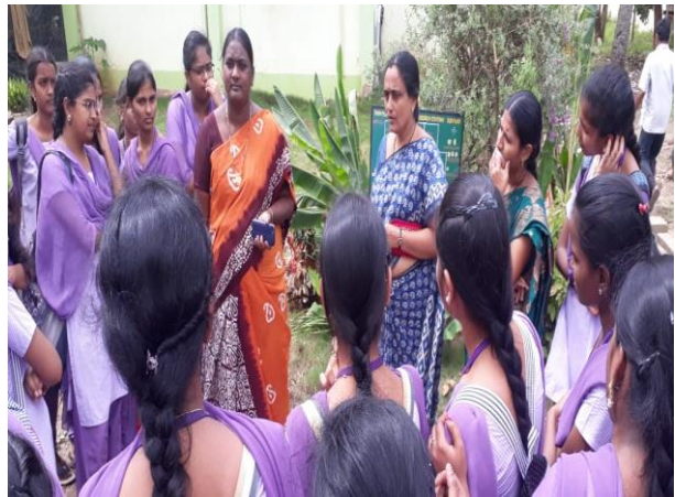
A FELID TRIP TO CENTRAL BANANA RESEARCH INSTIUTE