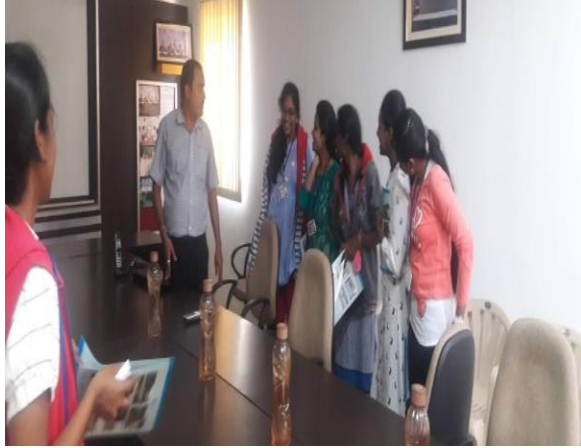
AN EDUCATIONAL TRIP TO NATIONAL RESEARCH CENTERS IN HYD.,