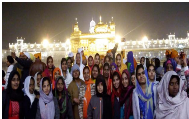
A RECERATIONAL TRIP TO DELHI AGAR , AMRITSAR & MADHURA