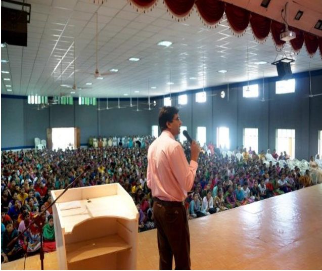
Guest lecture for all the degree students of the college