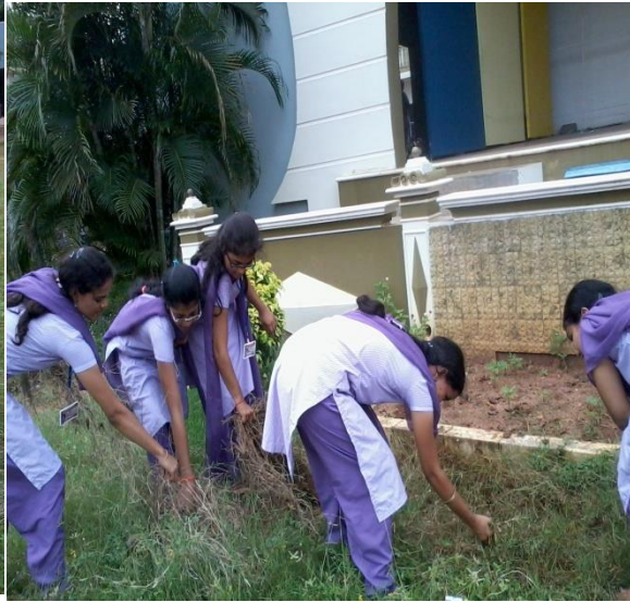
A part of Ecoclub regular activity: Clearing of excess grass in front of the open air stage.