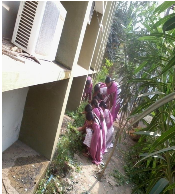
Students are cleaning the premises of Vermicompost unit every week and also watering the compost ones in every 3 days.