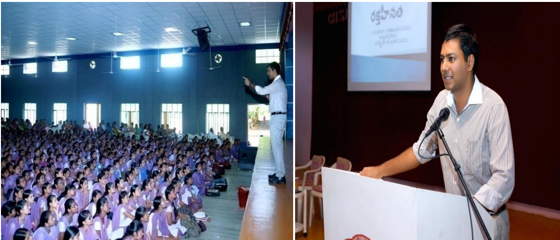
Guest lecture for all the degree students of the college